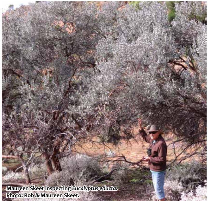
Maureen Skeet inspecting Eucalyptus educta .