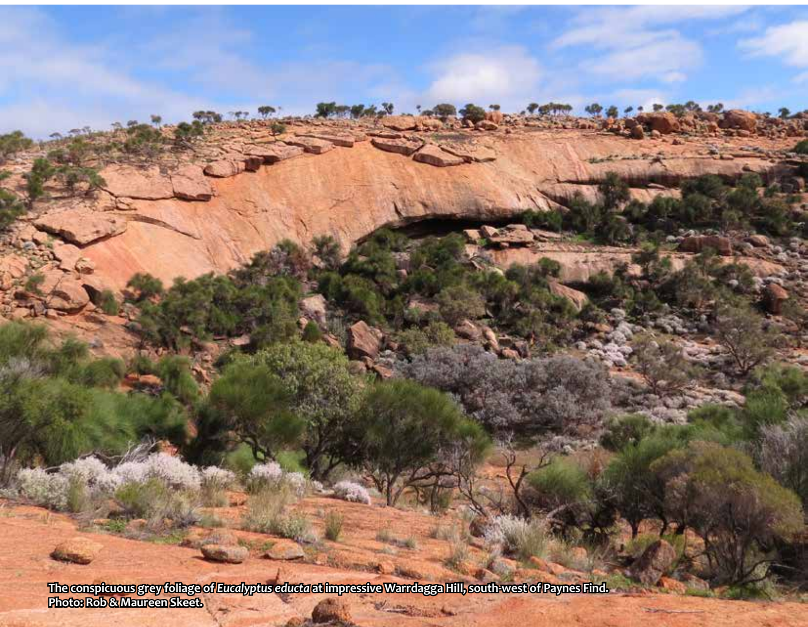
The conspicuous grey foliage of Eucalyptus educta at impressive Warrdagga Hill, south-west of Paynes Find.