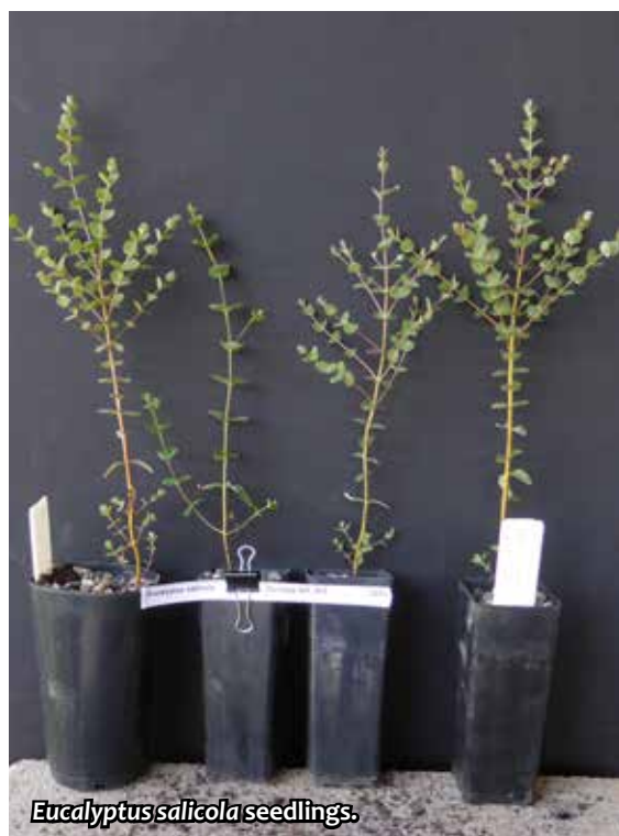
Eucalyptus salicola seedlings.

Special thanks to Ian Roberts , an exceptional botanical and bird artist from Medika Gallery in Blyth, SA, for cultivating and nurturing 170 different seedlings from the complex eucalypt group Eucalyptus series Porantherae . The seedlings of the group are quite diagnostic and as such four seedlings of each were selected to assist with plant identification/determination.