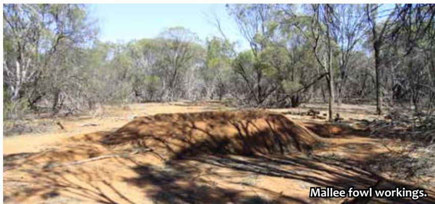
Mallee fowl workings.

During April did a quick trip to re-acquaint myself with one of the very rare eucalypts, Eucalyptus jutsonii subsp. kobela , located to the north-east of Perenjori in the near northern Pastoral region. Whilst there, I came across what I believe is a mallee fowl nest; 2.5 metres across.