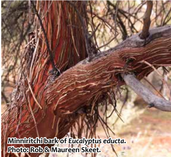
Minniritchi bark of Eucalyptus educta .

This autumn and early winter, many of our special granite rock dwelling eucalypts have been flowering profusely; definitely worth going for a drive as wildflower enthusiasts, Rob & Maureen Skeet will attest.