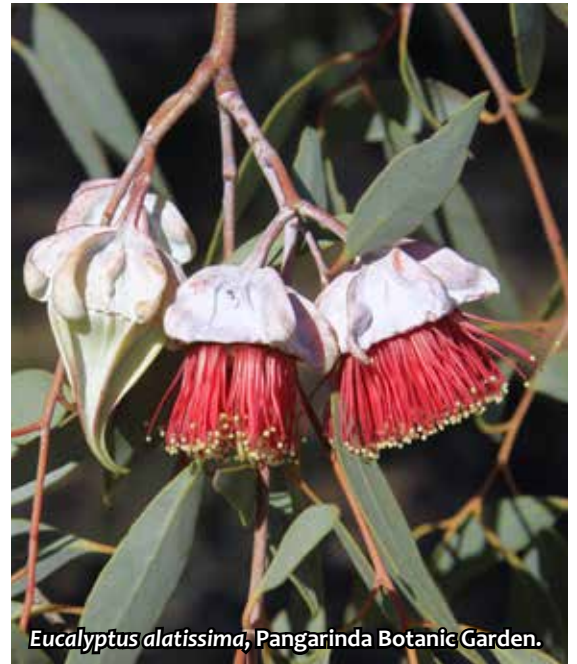
Eucalyptus alatissima , Pangarinda Botanic Garden.