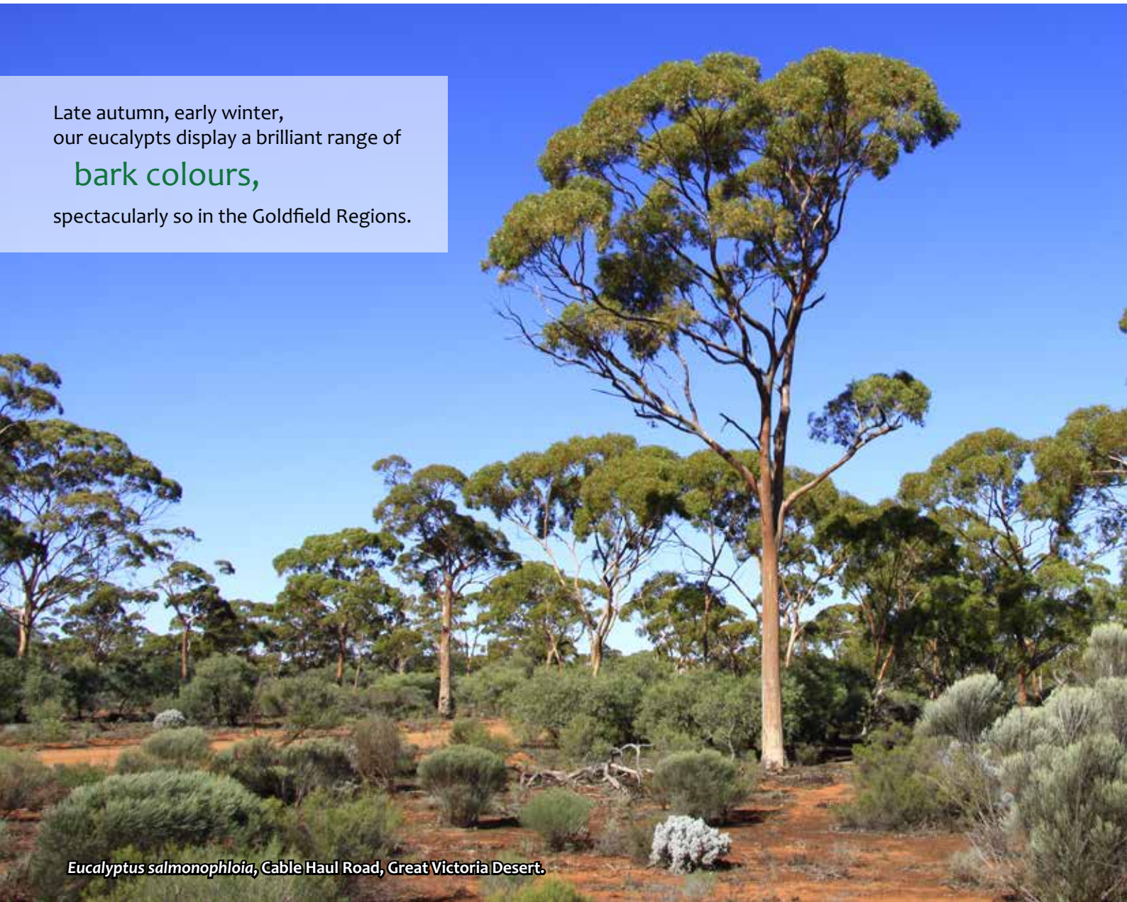
Eucalyptus salmonophloia , Cable Haul Road, Great Victoria Desert.

Late autumn, early winter, our eucalypts display a brilliant range of bark colours, spectacularly so in the Goldfield Regions.