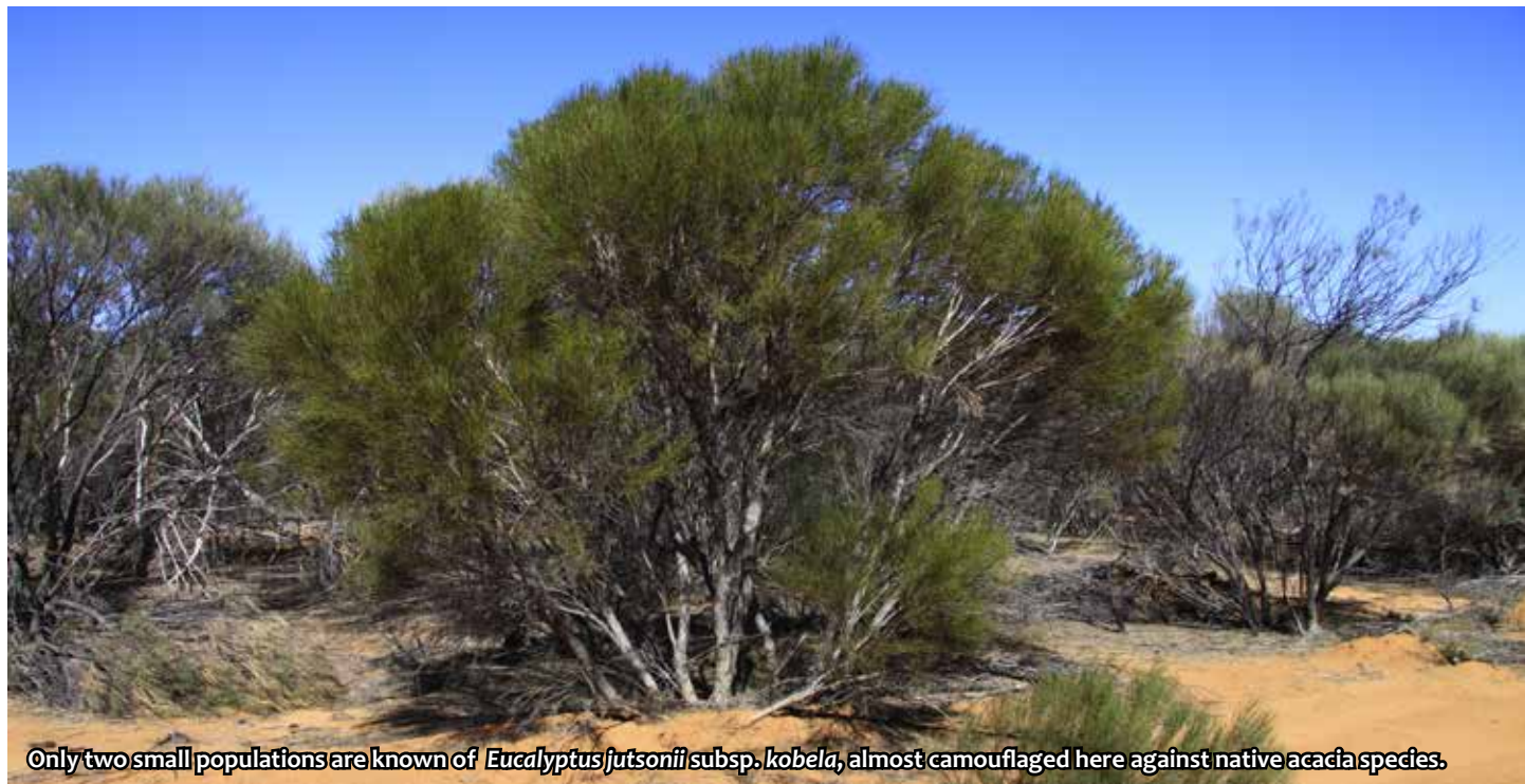
Only two small populations are known of Eucalyptus jutsonii subsp. kobela , almost camouflaged here against native acacia species.

Any comments or questions, please contact me under mef@eucalyptsofwa.com.au .