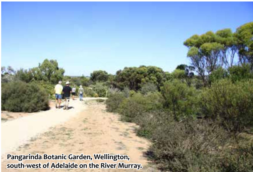
Pangarinda Botanic Garden, Wellington, south-west of Adelaide on the River Murray.

Known as Pangarinda Botanic Garden and open to the public, if you're over that way, make sure it's on your agenda. Outstanding it is, presenting inspiration to any of our WA shires that wish to do similarly. Even had royal hakeas ( Hakea victoria ) and the very rare Eucalyptus brandiana from WA's Fitzgerald River National Park.