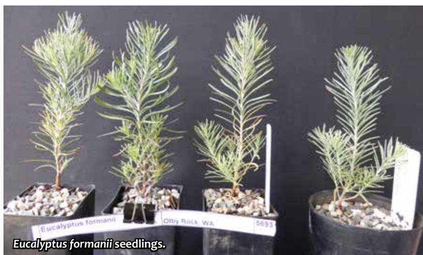
Eucalyptus formanii seedlings.

Special thanks to Ian Roberts , an exceptional botanical and bird artist from Medika Gallery in Blyth, SA, for cultivating and nurturing 170 different seedlings from the complex eucalypt group Eucalyptus series Porantherae . The seedlings of the group are quite diagnostic and as such four seedlings of each were selected to assist with plant identification/determination.