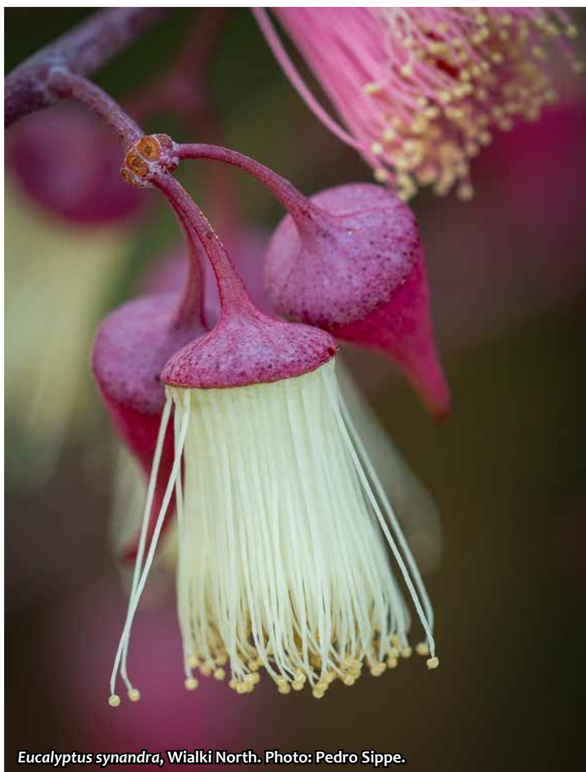
Eucalyptus synandra , Wialki North.