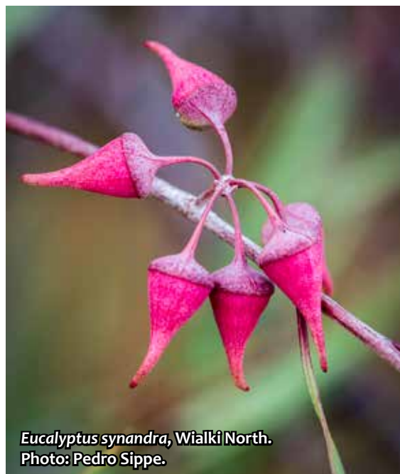
Eucalyptus synandra , Wialki North.