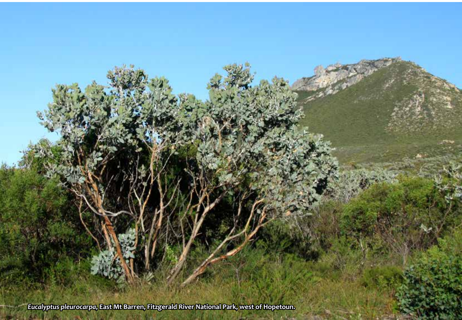
Eucalyptus pleurocarpa , East Mt Barren, Fitzgerald River National Park, west of Hopetoun.