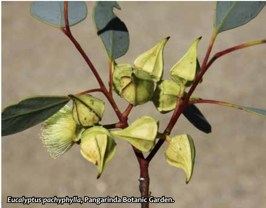
Eucalyptus pachyphylla , Pangarinda Botanic Garden.