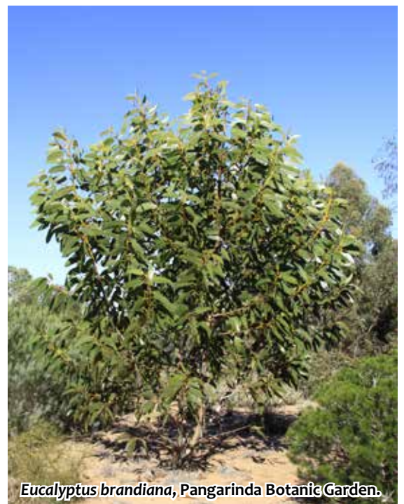
Eucalyptus brandiana , Pangarinda Botanic Garden.