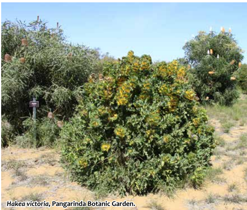
Hakea victoria , Pangarinda Botanic Garden.

Known as Pangarinda Botanic Garden and open to the public, if you're over that way, make sure it's on your agenda. Outstanding it is, presenting inspiration to any of our WA shires that wish to do similarly. Even had royal hakeas ( Hakea victoria ) and the very rare Eucalyptus brandiana from WA's Fitzgerald River National Park.