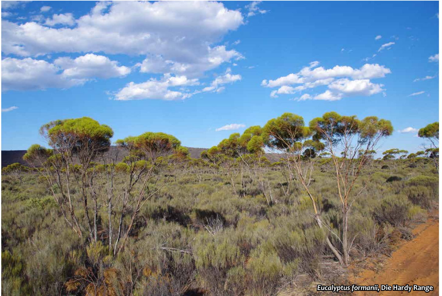
Eucalyptus formanii , Die Hardy Range