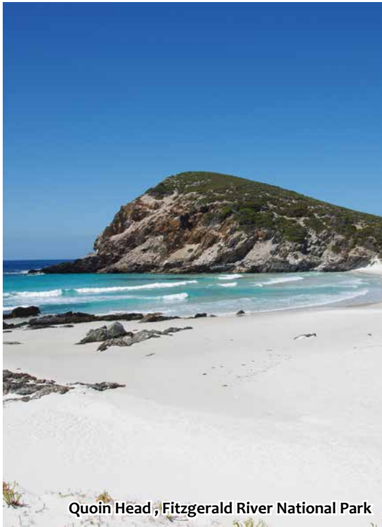
Quoin Head , Fitzgerald River National Park