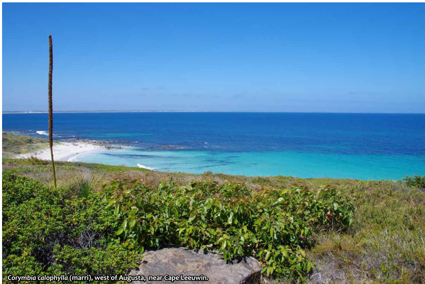
Corymbia calophylla (marri), west of Augusta, near Cape Leeuwin.

just east of the most south-westerly point of Australia, where the salt laden winds blow almost unabated. Marri (also known as red gum) usually grows from 10 to 20 metres tall and in the southern forests to 60 metres. Here it is just ½ a metre tall!