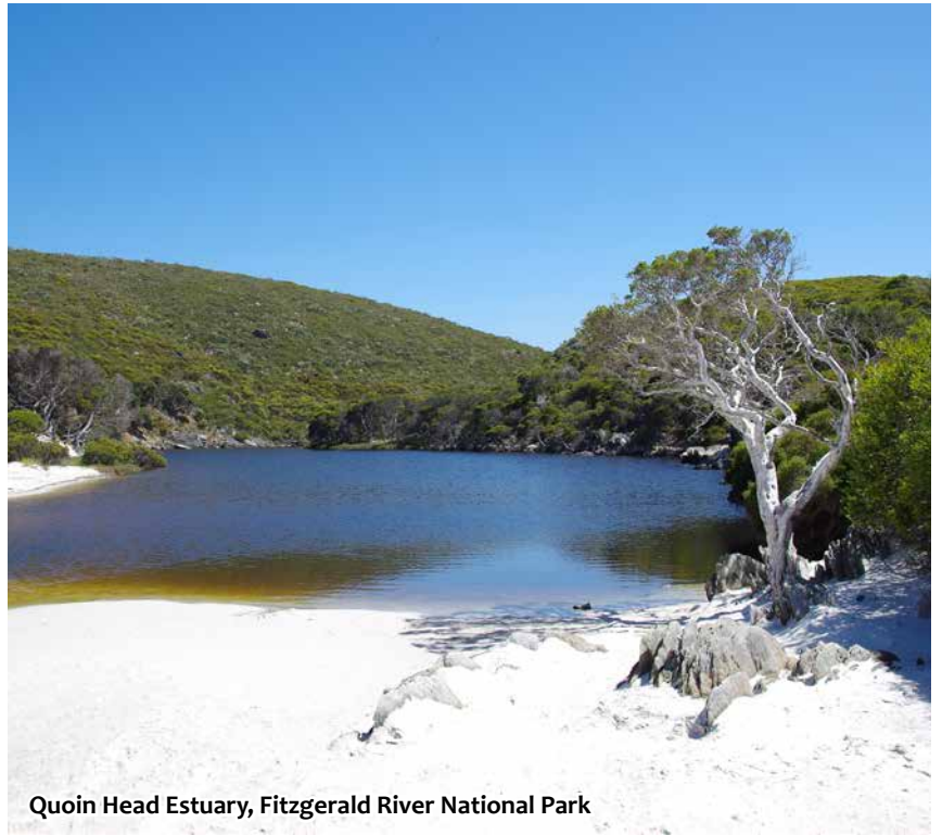
Quoin Head Estuary, Fitzgerald River National Park