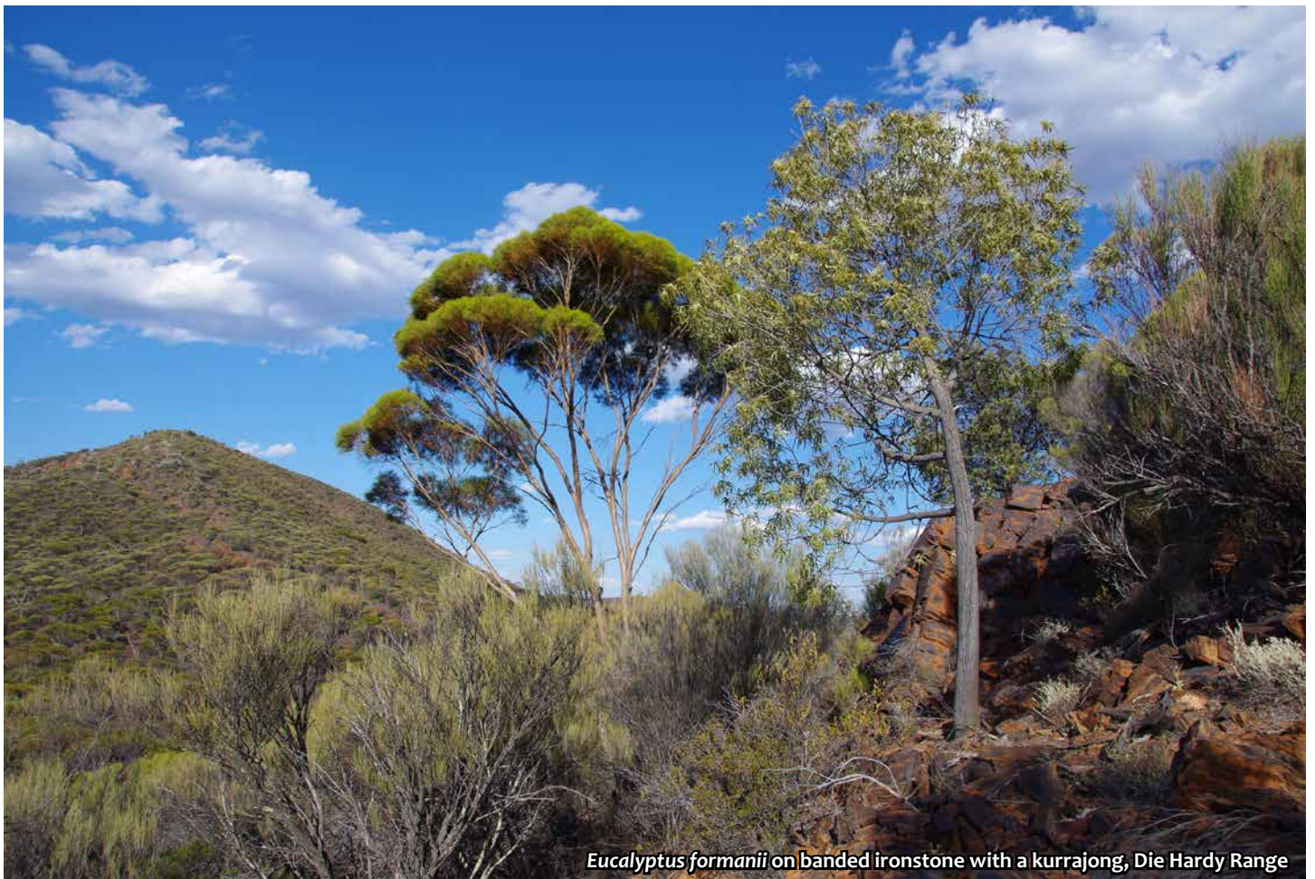
Eucalyptus formanii on banded ironstone with a kurrajong, Die Hardy Range