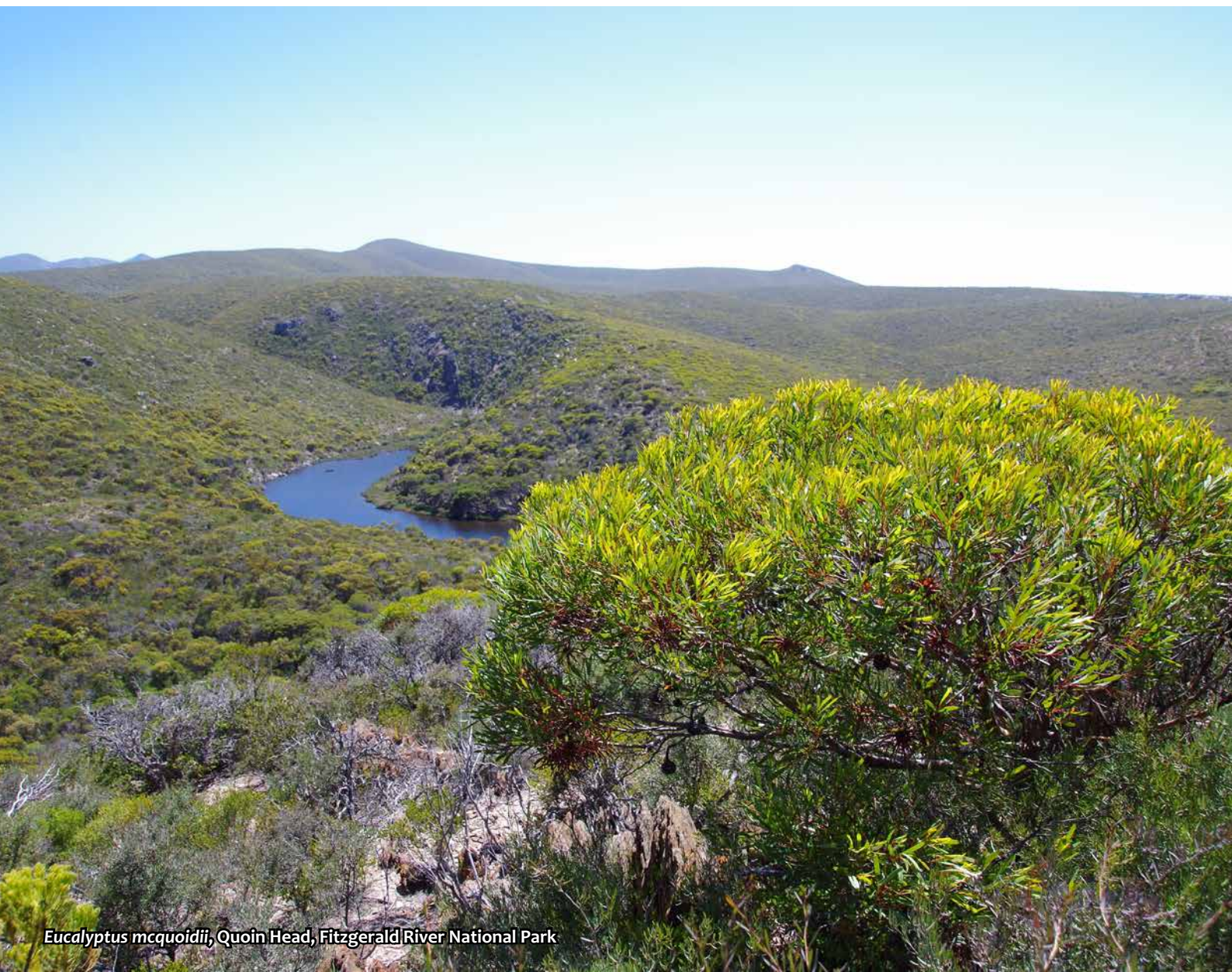
Eucalyptus mcquoidii , Quoin Head, Fitzgerald River National Park