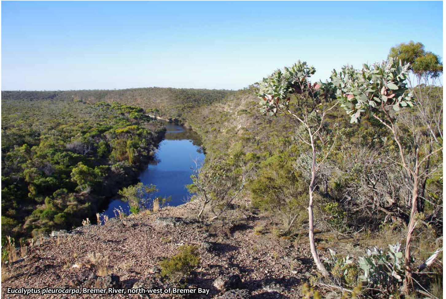
Eucalyptus pleurocarpa , Bremer River, north-west of Bremer Bay