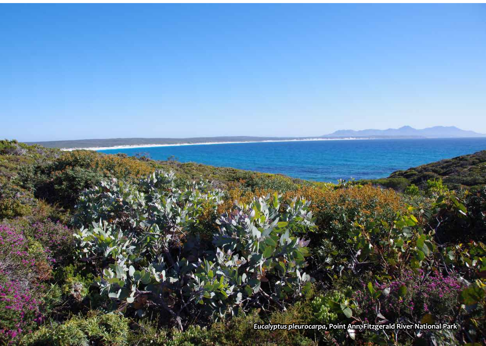
Eucalyptus pleurocarpa , Point Ann, Fitzgerald River National Park