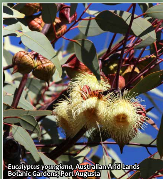
Eucalyptus youngiana , Australian Arid Lands Botanic Gardens, Port Augusta