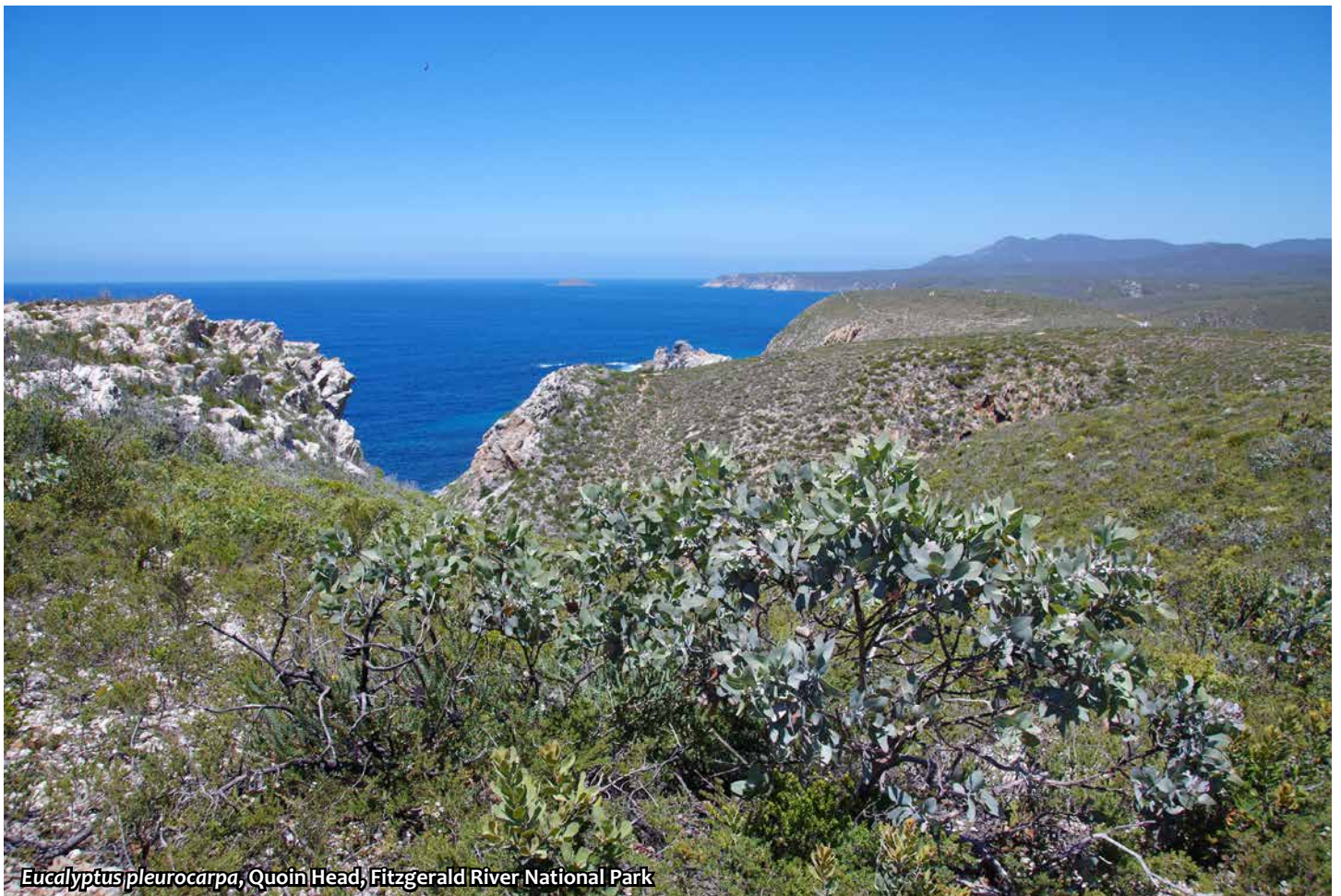
Eucalyptus pleurocarpa , Quoin Head, Fitzgerald River National Park