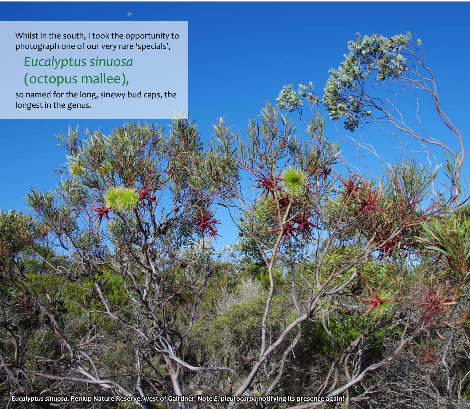
Eucalyptus sinuosa , Peniup Nature Reserve, west of Gairdner. Note E. pleurocarpa notifying its presence again!

so named for the long, sinewy bud caps, the longest in the genus.