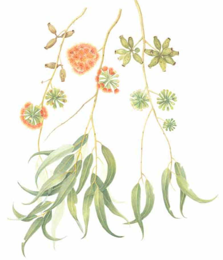
Eucalyptus phoenicea, 'scarlet gum', Kimberley WA, NT & Qld.