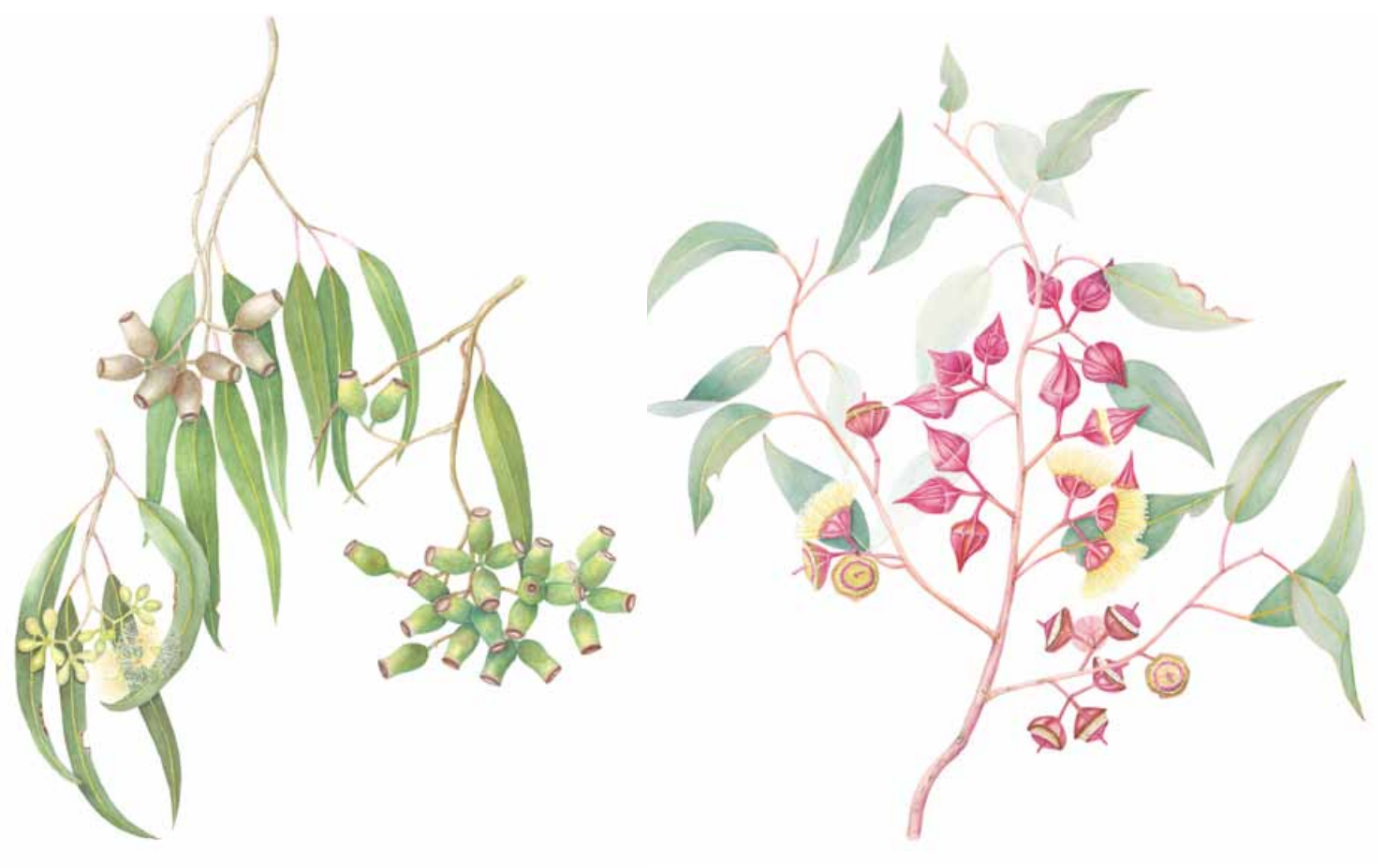
Corymbia polycarpa, 'long-fruited bloodwood', Kimberley WA, NT & Qld.