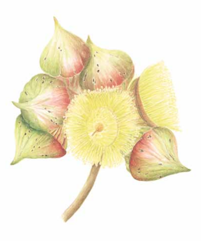
Eucalyptus youngiana, 'Ooldea mallee', Great Victoria Desert WA & SA.